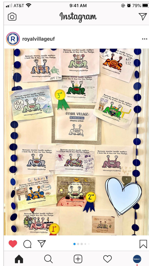
At Royal Village in Gainesville, Fla., Hi How Are You Project's iconic "Jeremiah the Innocent" frog was the hero for this activity that brought awareness about the importance of mental health and checking in on others.