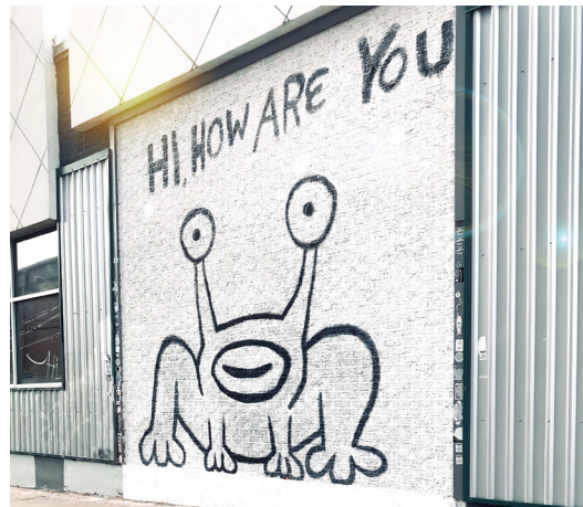
"Jeremiah, the Innocent" mural at the Goodall Wooten in Austin.

It is inspired by musician and artist, Daniel Johnston, who passed away in 2019 after struggling with mental health issues for many years. His famous artwork "Jeremiah the Innocent," a mural bearing the question "Hi, How Are You?," is found on the Goodall Wooten building at the University of Texas at Austin. ACC purchased the building in 2018 to renovate into a student residential community in their hometown headquarters. That's when the partnership began and has since been a guiding tenet for ACC's Residence Life program, which offers events and information on health, wellness and student success for residents.